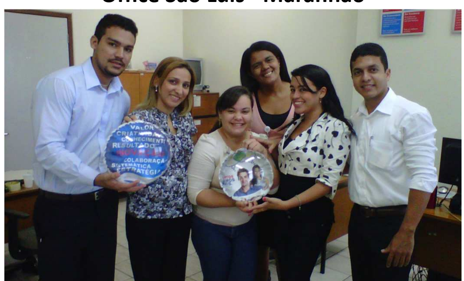
Office São Luis - Maranhão